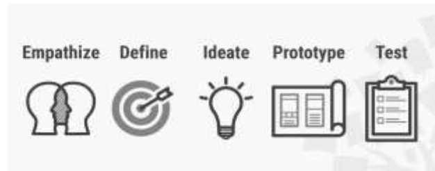
Figure 1. The figure illustrates the design thinking framework

Due to the iterative and R&D focused nature of the Project, WHH seeks a service provider from the private sector that has the required capacity and interest in intensively engaging and working alongside WHH's Product Development Team in all three phases of research / immersion, ideation and testing during the anticipated two (2) year contract period.